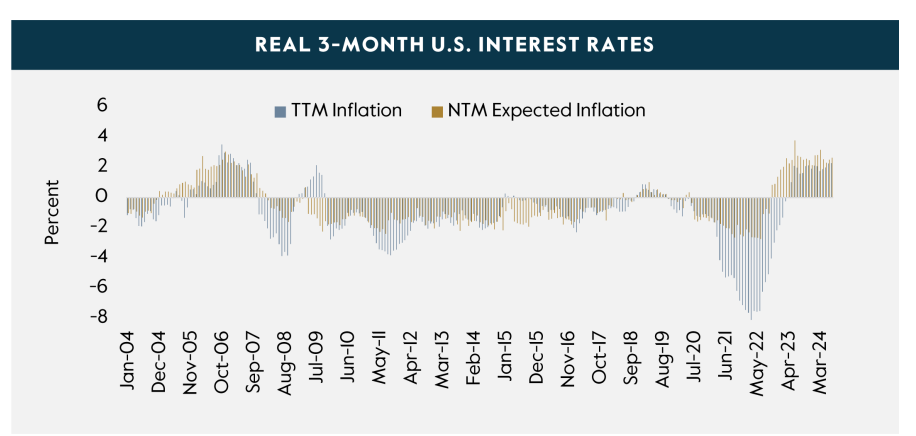
Figure 1: Rates Again in Unfamiliar Territory