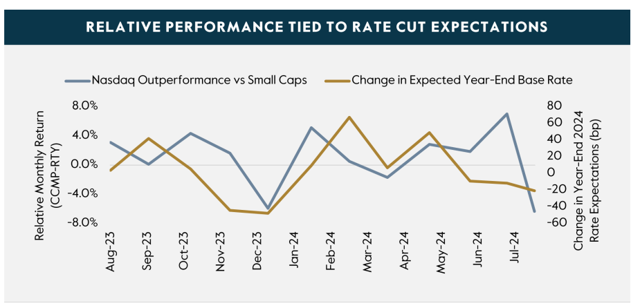
Figure 3: Market Unwind Tied to Changed Rate Expectations

There is no guarantee any trends will continue