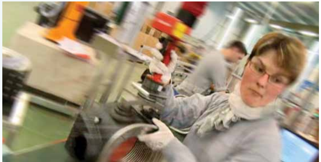
EPOfilms European Inventor of the Year Award 2009